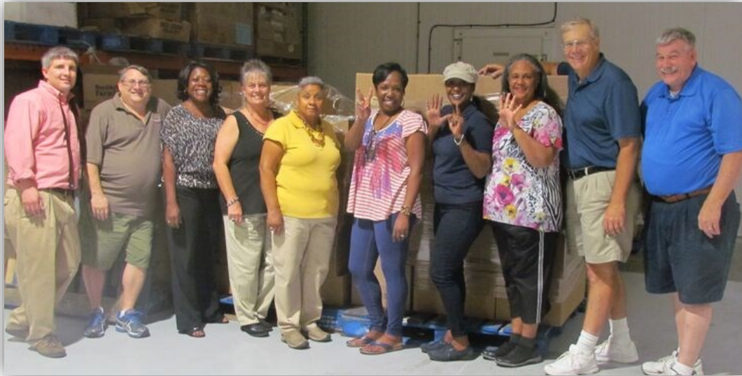
Peach Council members and friends gathered on Saturday afternoon at the Second Harvest Food Bank in Savannah to package food boxes to be distributed to those in need. Approximately 264 boxes were packaged, sealed and ready to deliver.

Peach Council members gathered in Savannah, Georgia for it's quarterly meeting hosted by the CELDA Chapter. The group enjoyed dinner on the Riverwalk on Friday evening and watched fresh salt water taffy being wrapped at a local candy store. Everyone enjoyed lunch at the Pirate House on Saturday. Our community outreach activity this quarter was arranged by CELDA. Members formed an assembly line to pack food boxes to be distributed to needy families the following week. A very rewarding experience for us all.