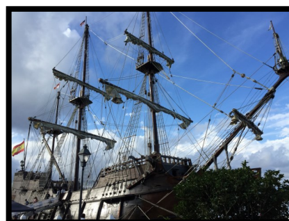
A tour of the El Galeon rounded out the day with rich history and a movie.