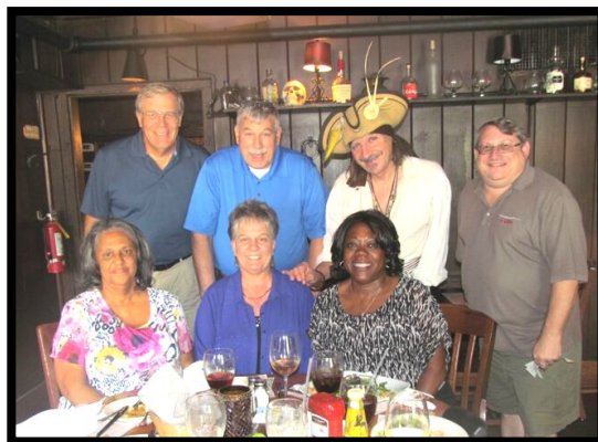
We were not surprised when a Pirate joined us at our table during lunch.

The Pirates House is a favorite spot to have lunch and spend time relaxing with friends. A nice break from our busy meeting schedule.