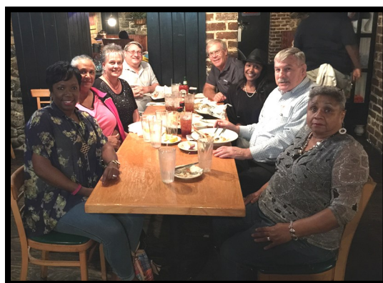
Dinner on the Riverwalk was an evening affair with lots of food and drink.