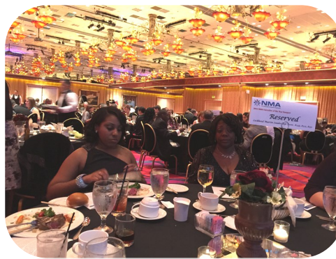
National Awards Banquet