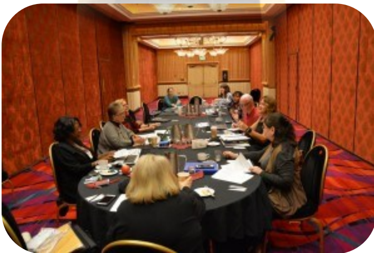
Recognition Committee Meeting