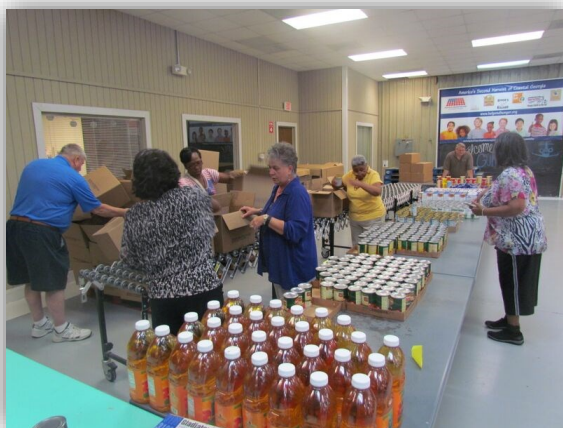
The Council, hard at work, in the warehouse. An assembly line was the most efficient way to pack the boxes.

Peach Council members gathered in Savannah, Georgia for it's quarterly meeting hosted by the CELDA Chapter. The group enjoyed dinner on the Riverwalk on Friday evening and watched fresh salt water taffy being wrapped at a local candy store. Everyone enjoyed lunch at the Pirate House on Saturday. Our community outreach activity this quarter was arranged by CELDA. Members formed an assembly line to pack food boxes to be distributed to needy families the following week. A very rewarding experience for us all.