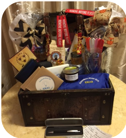
Treasure chest of items donated to the Silent Auction by the Peach Council Chapters; LMLA (Greenville and Marietta), SRSLA, and CELDA