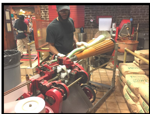
You can't make a trip to Savannah without visiting the candy shop on the river. Here we watched fresh made salt water taffy being wrapped while enjoying just a few pieces.